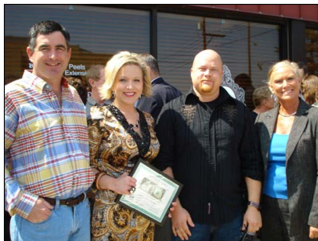
Mirror Mirror MedSpa located at 106 North 5 th