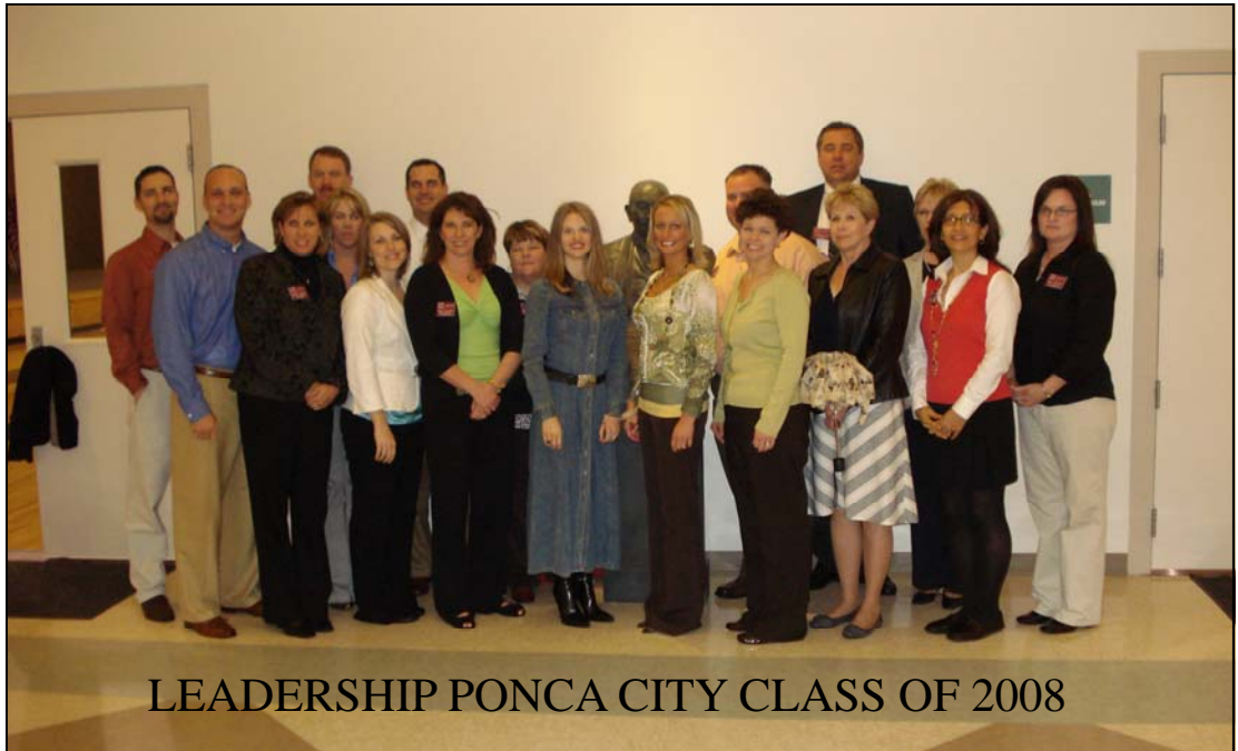
LEADERSHIP PONCA CITY CLASS OF 2008