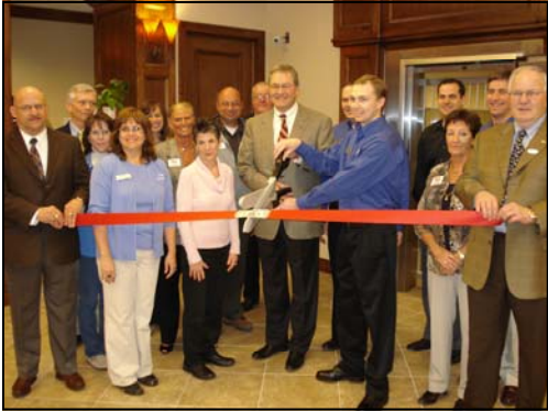
First National Bank of Oklahoma located at 1501 East Prospect