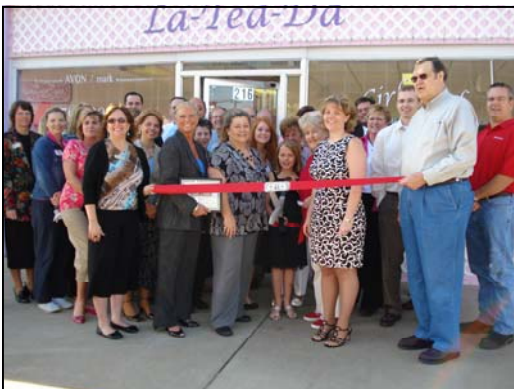
La Tea Da located at 216 East Central