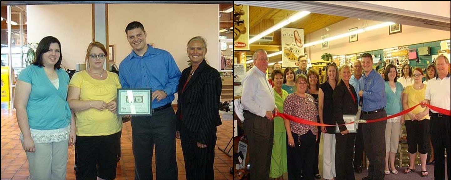
Ribbon Cutting Ceremony for Brown’s Shoe Fit Company located in Ponca Plaza.