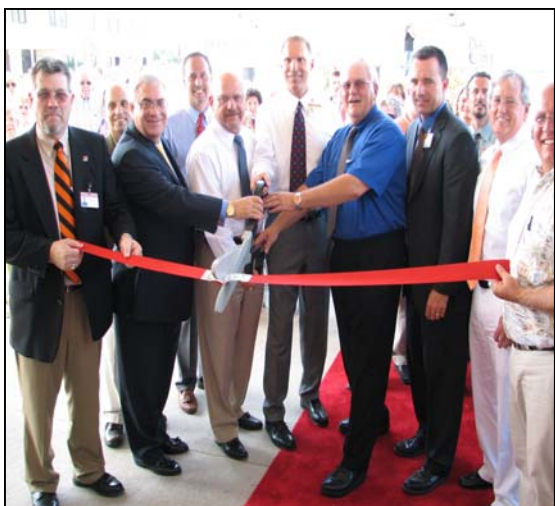
A Ribbon Cutting Ceremony was held for the new and expanded Ponca City Medical Center Emergency Room. Hundreds attended this exciting event. Ponca City Medical Center has delivered on several promises made when they purchased our hospital a couple of years ago including their promise to build a new ER. Thank You PCMC!