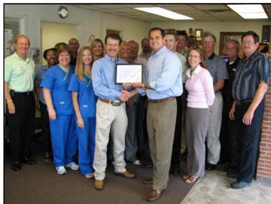
"BLANTON CHIROPRACTIC CLINIC"