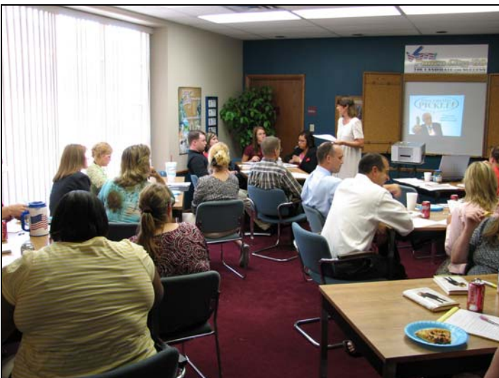
Thank you ConocoPhillips for the grant to sponsor the Ponca City Business Council's business workshop "Give em the Pickle". We also want to thank Pioneer Technology Center for teaching the workshop.